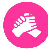
Supporting developing nations