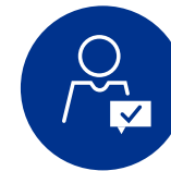
Listening and taking action