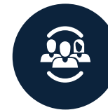
Collaborations and alliances